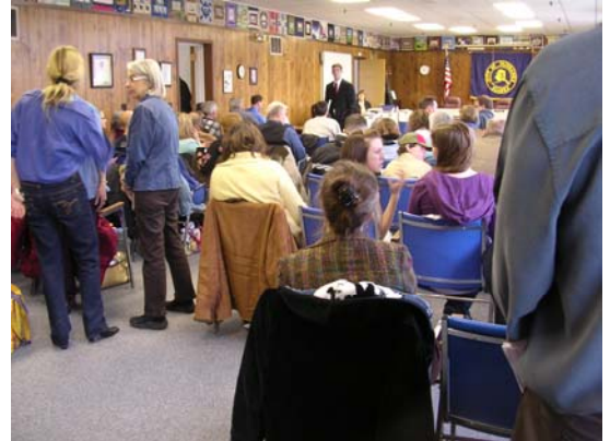
April 7, 2008 City Council Meeting on Vision Fairbanks

The date for the Borough Assembly to consider adopting Vision Fairbanks into the FNSB Comprehensive Plan has not yet been set. When the time does come, people will be asked to once again come out in their blue shirts to support this vital plan for the revitalization of the downtown area.